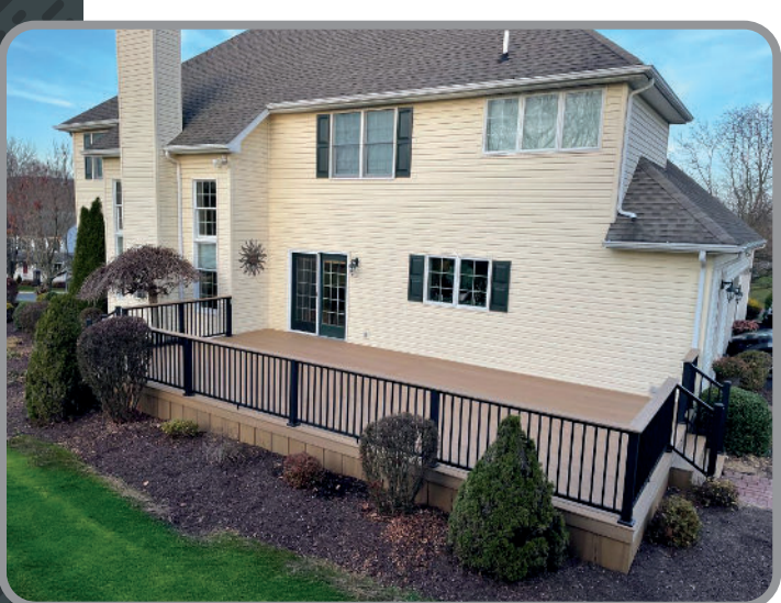
Vertical Skirting • Drink Rail