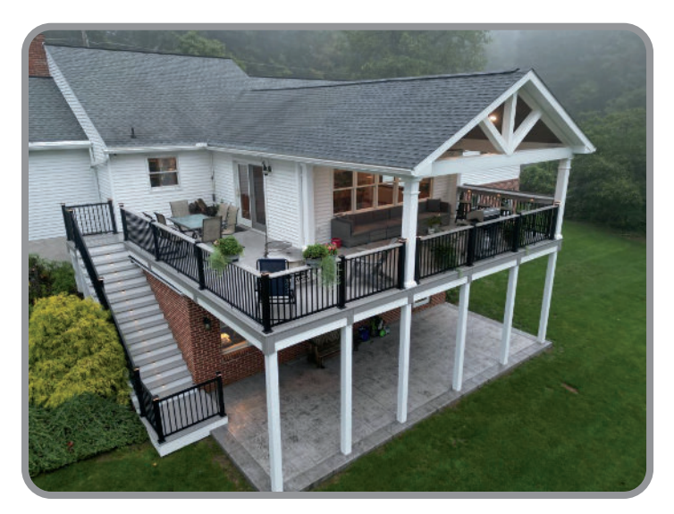
Decks • Patios • Stairs • Pavilions Lighting • Drink Rail • Vinyl Post Sleeves