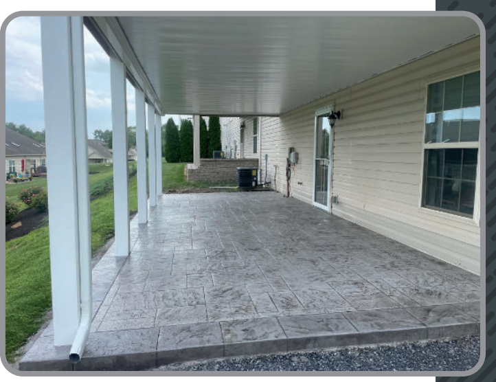
Stamped Concrete Patios Otter-Tech Under Decking