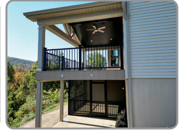
Screened In Porches